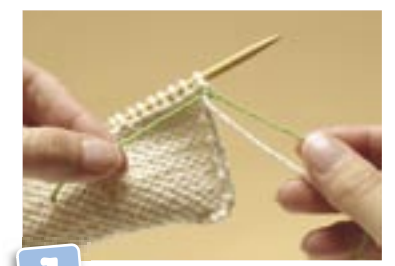
Knot the new ball to the existing yarn, leaving a 2in (5cm) tail. Push the knot up to meet the knitting.