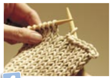
When you get to the last stitch, if you are casting off the whole row, cut the yarn about 6in (15cm) away, feed it through the loop and pull tight.