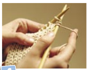
Now carefully insert the tip of the right-hand needle into the front loop of the stitch you're currently working on.