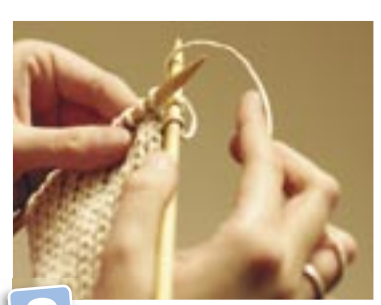
Wind the wool around the tip of the right-hand needle, just as you would when doing a standard knit stitch.