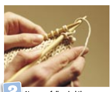
Now carefully wind the yarn around the tip of the right-hand needle, as you would to create an ordinary knit stitch.