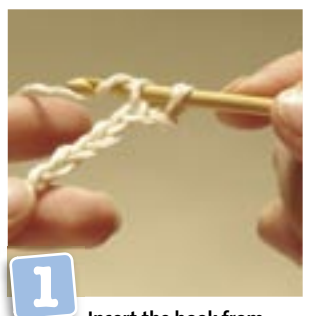
Insert the hook from front to back under the top of the second chain from the hook. Wrap the yarn round the hook (know as yrh).