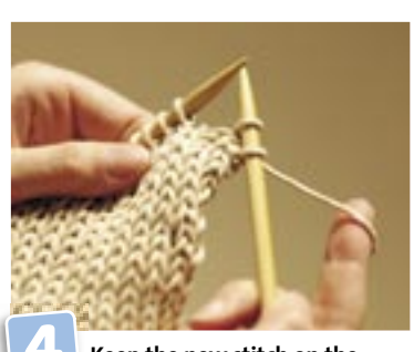
Keep the new stitch on the right-hand needle. Continue knitting until you need to decrease again and repeat steps 1-3.