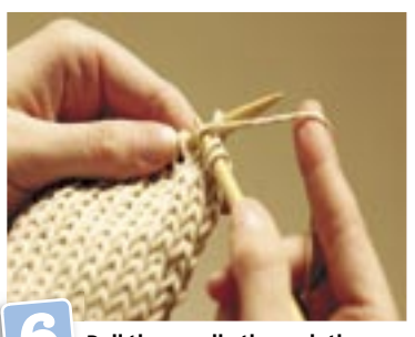
Pull the needle through the loop, catching the yarn as you go with the index finger of your right hand.