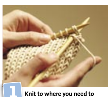
Knit to where you need to start decreasing. Then knit 2 sts together (kztog) by inserting the point of the needle through the loop of the next two stitches, as shown above.