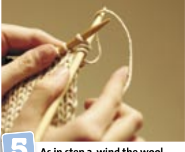
As in step 2, wind the wool around the tip of the right needle again, as you would for an ordinary knit stitch.