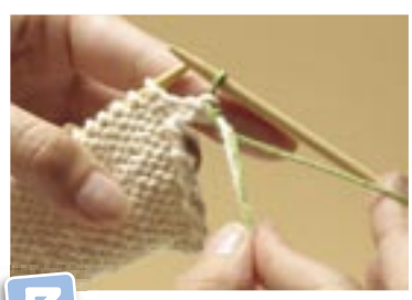
To secure the tails, twist them with the ball end yarn as you work each stitch, ensuring the weave is on the wrong side of your work.