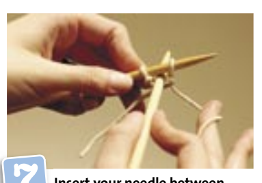
Insert your needle between the stitches at the end of the left-hand needle and repeat steps 1-6 until you have the number of stitches you require.