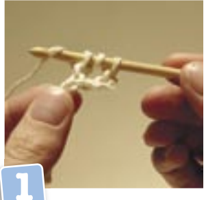
Make a foundation chain. Skip 3ch, yrh, insert the hook under the loop of the 4th ch, yrh.