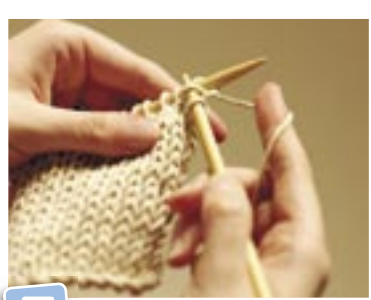
Pull the needle through, catching the yarn as for a knit stitch, but don't take the stitch off the left-hand needle.