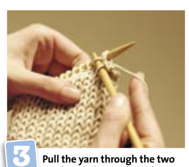
Pull the yarn through the two stitches and onto the right-hand needle.