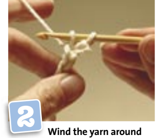
the hook and pull it through the chain loop, leaving two loops on your crochet hook.