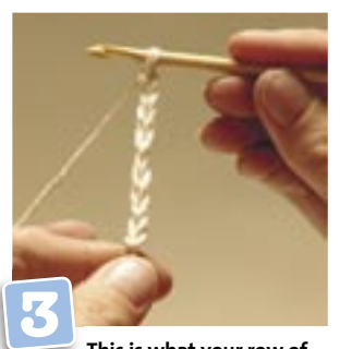
This is what your row of chains will look like. Keep going until you have the number of chains stated on your pattern.