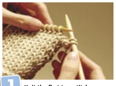
Knit the first two stitches as normal, but don't go any further along the row.