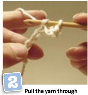
both loops on the hook to make a slip stitch. To carry on working a row of slip stitch, insert the hook into the next chain down and so on, repeating step 2 each time.