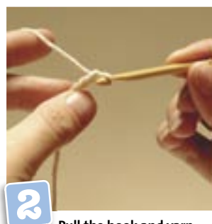
Pull the hook and varn back through the slipknot loop to form the first chain stitch.