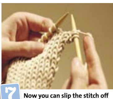
Now you can slip the stitch of the left-hand needle to leave three stitches on your right needle.